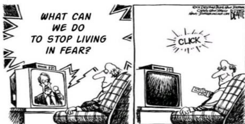
Mike Blackwell, President

of personal circumstances and to respect those whose circumstances are different from our own. Together we will get through all of this! In the meantime, we are happy to be able to pave a way forward and look forward to eventually meeting all of you . . . . regardless of which fork in that road you may choose!