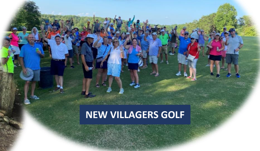
NEW VILLAGERS GOLF