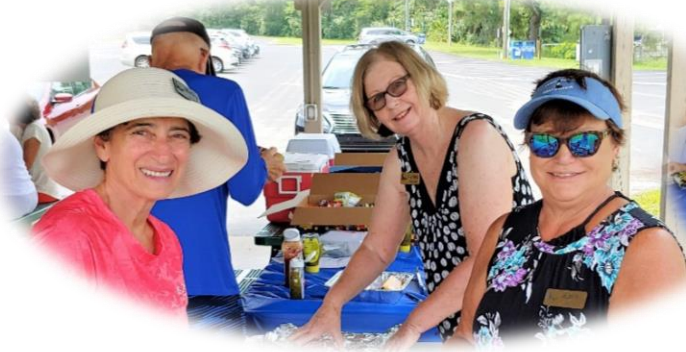
TUGALOO BEACH PARTY