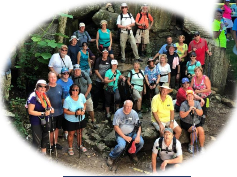
MUDDY BOOTS HIKERS