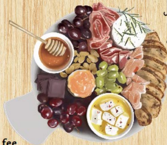
sample picture only

Contact Pamela Holasek mommydance33@gmail.com