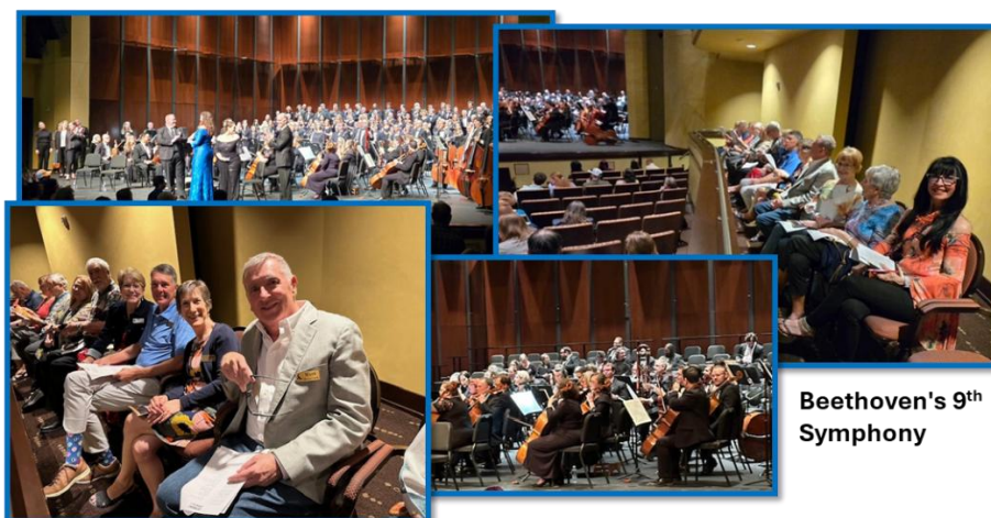
Beethoven's 9 th Symphony

We have a number of exciting Events scheduled for the rest of April and into May that are still open for registration. A few of the events are highlighted in the following pages along with a listing of all open events. Go onto the TellicoLife NV calendar to sign up and join the fun. We have more fun events planned to be opened up after this coming May Social if you missed out on any of these.