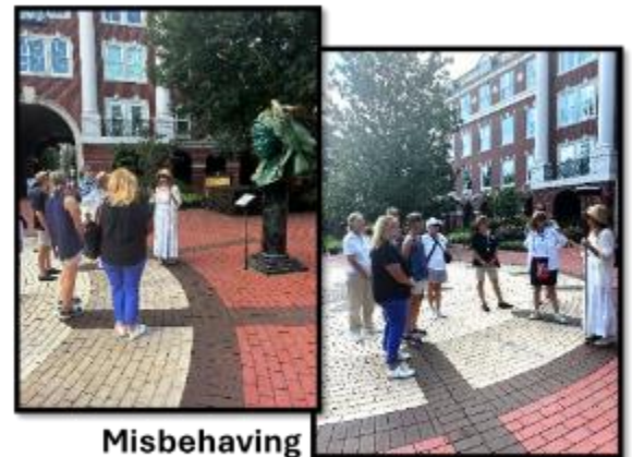
Misbehaving Women History Tour