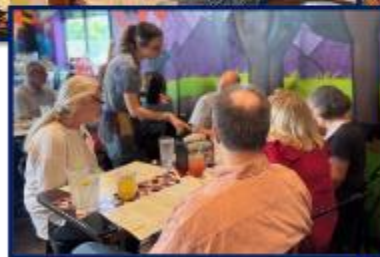
Tacos & Tequila