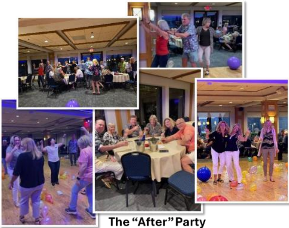
The "After" Party