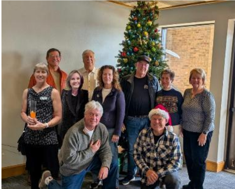
2025 New Villagers Board

As you can see, we had a very busy 2025. We wouldn't have had it any other way. It was our privilege and pleasure to serve New Villagers. We may be retiring from the board this year, but you will still see us at New Villagers events and throughout the village. Thank you all for making this a very special club.