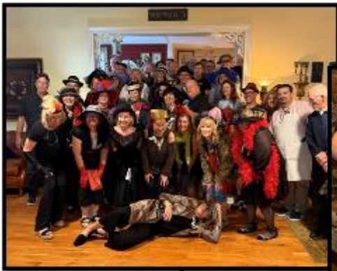
Death at a Speakeasy