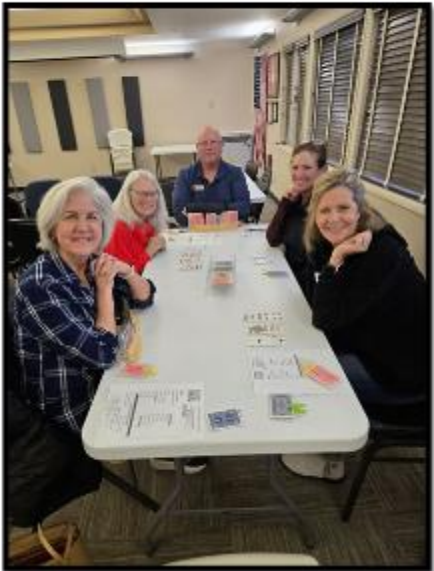
Hand and Foot Practice