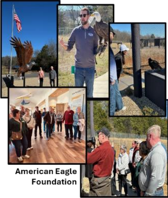
American Eagle Foundation