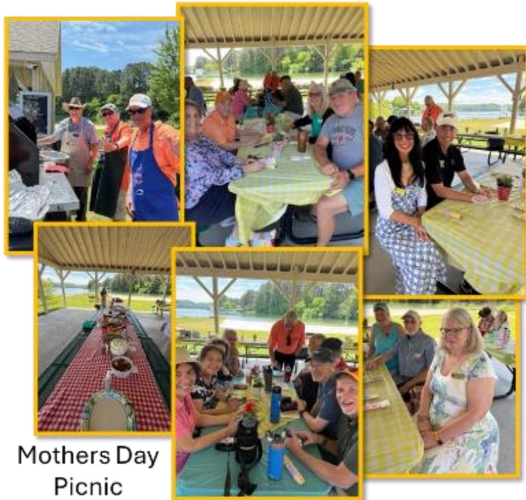
Mothers Day Picnic