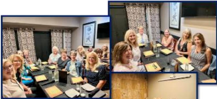
Ladies Lunch Bunch