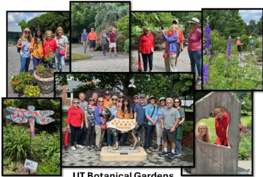
UT Botanical Gardens