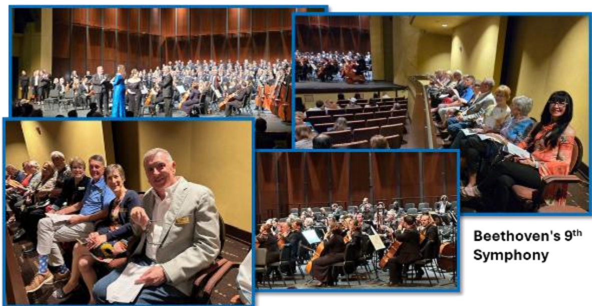
Beethoven's 9 th Symphony