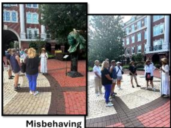
Misbehaving Women History Tour