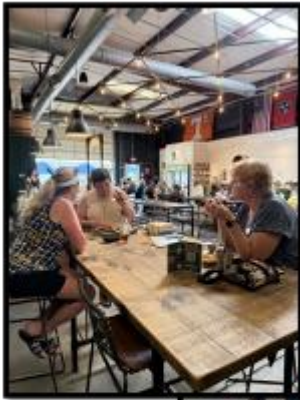
Peaceful Side Brewery