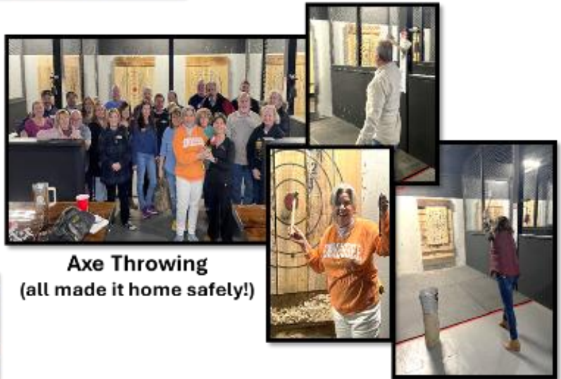
Axe Throwing (all made it home safely!)