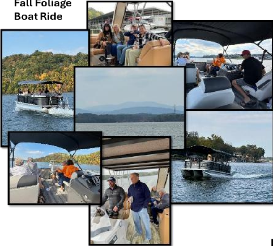
Fall Foliage Boat Ride