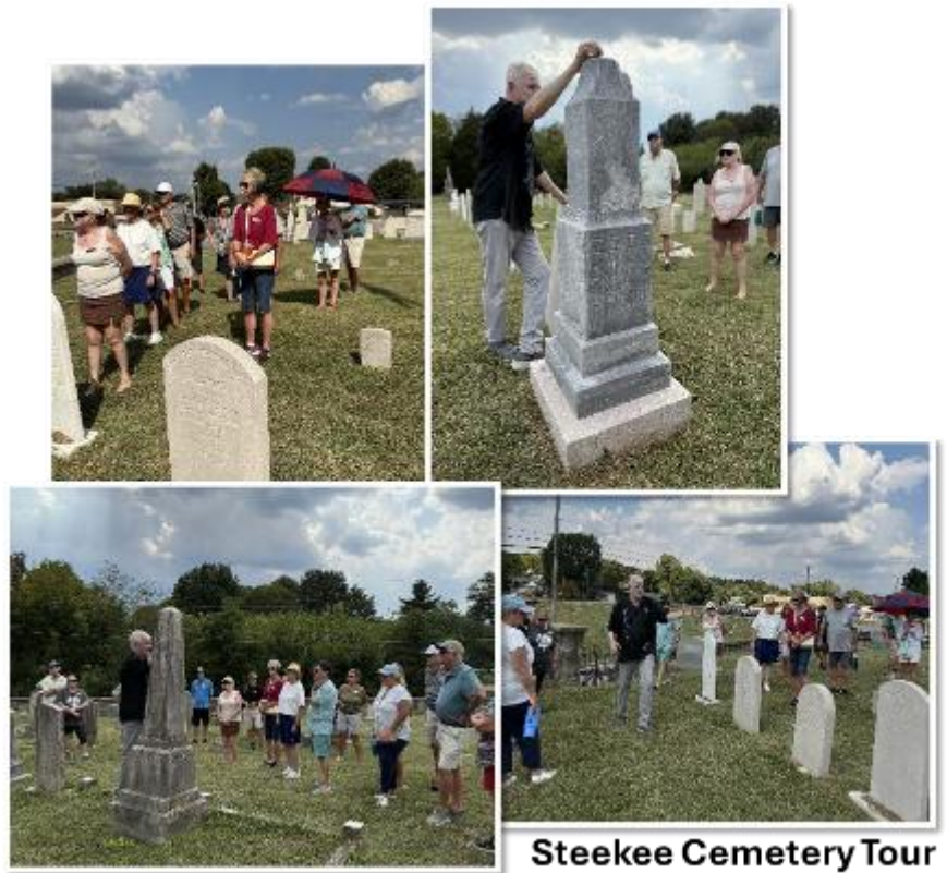
Steekee Cemetery Tour