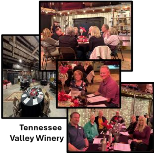
Tennessee Valley Winery