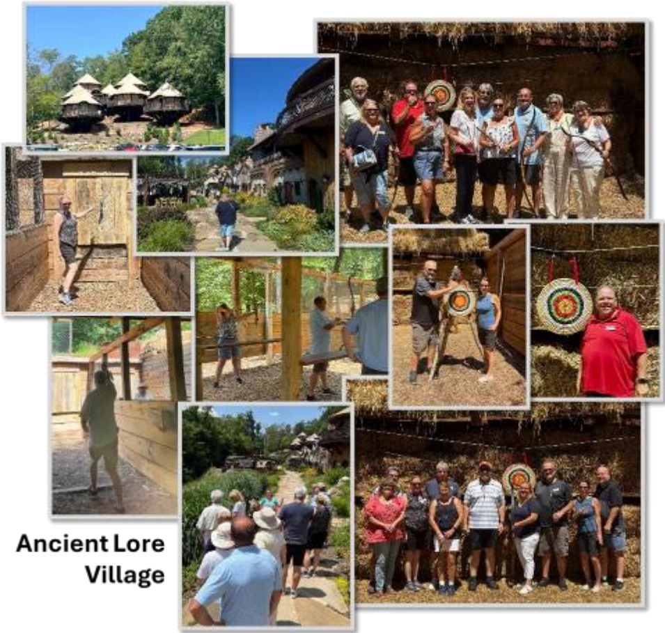
Ancient Lore Village