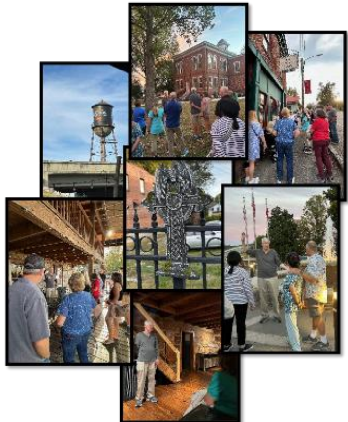
Loudon Ghost Tour