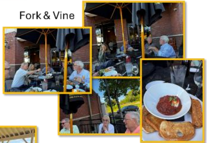
Fork & Vine