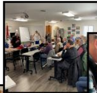
Stop the Bleed Class