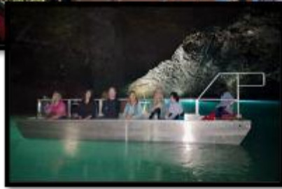
Lost Sea Adventure