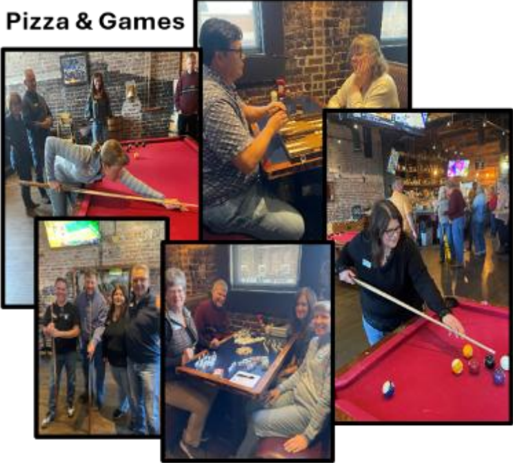
Pizza & Games