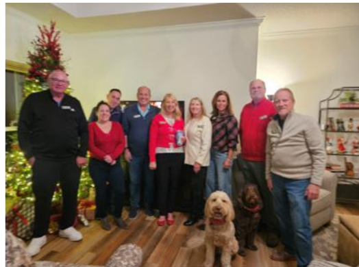
Christmas in Kahite