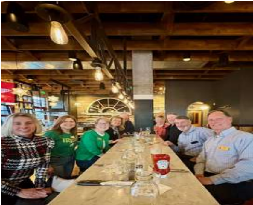
The Local Bite